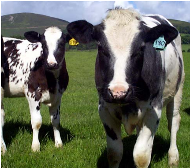
Fig 1: Parasitic gastroenteritis is more often encountered in dairy calves grazing contaminated pasture during their first season.