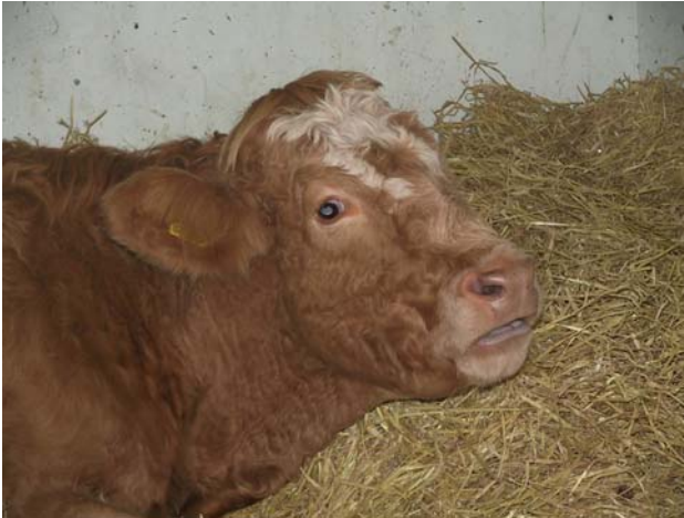
Fig 7: Cattle severely affected by lungworm may be reluctant to move, hold their head down, neck extended, and cough frequently.

Early clinical signs in growing cattle (and dry dairy cows) include an increased respiratory rate at rest, but more noticeable, frequent coughing especially after short periods of exercise. Severely affected cattle may be reluctant to move, stand with their head down, neck extended, and cough frequently.