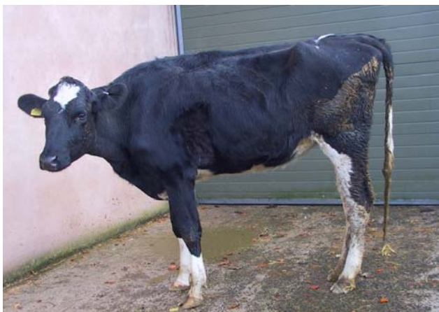
Fig 2: Parasitic gastroenteritis affecting a growing dairy heifer grazing contaminated pasture during its first summer at grass

In spring-calving beef herds, early season pasture contamination of developing larvae is ingested by immune adult cows which results in restricted egg output and subsequent low larval challenge to the calves later in the grazing season. Autumn-born beef calves graze little before housing and are generally weaned at turnout before larval challenge occurs during the next summer. Problems could arise when these weaned beef calves graze contaminated pasture during their second season if they have not gained sufficient immunity as young calves during the previous autumn.