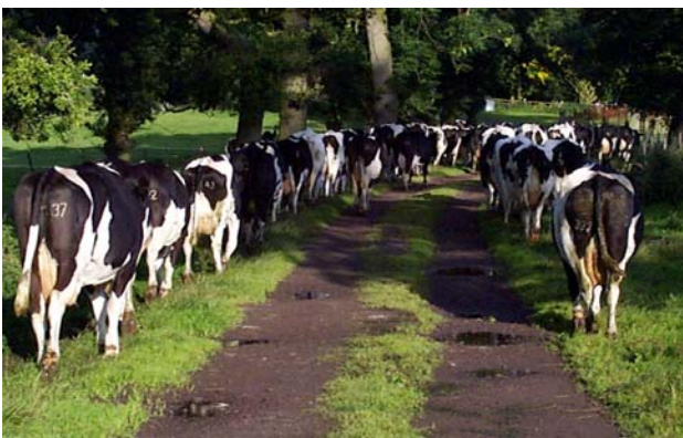
Fig 8: In the dairy herd, a reduction in bulk tank is noted along with frequent coughing when cows are walking to and from the milking parlour.

In the dairy herd, a reduction in bulk tank is noted along with frequent coughing when cows are walking to and from the milking parlour. Infection of susceptible cattle can result in a dramatic reduction