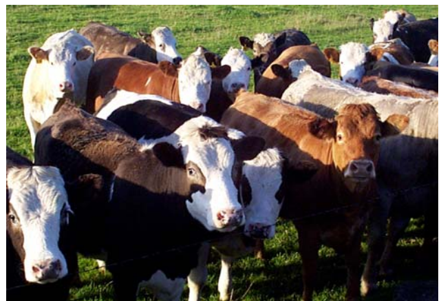
Fig 3: Parasitic gastroenteritis is more often encountered in weaned autumn-born beef calves grazing contaminated pasture during their second season.