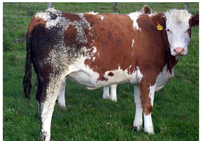
Fig 4: Parasitic gastroenteritis in a weaned autumn-born beef yearling grazing contaminated pasture during its second season.