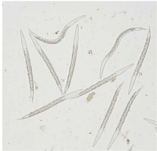
Fig 9: Lungworm larvae in the faeces of an affected calf

Diagnosis of patent lungworm infestation is based upon the demonstration of lungworm larvae in the faeces.